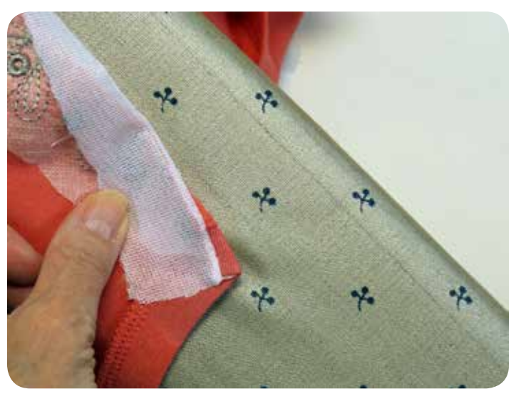
Press the interfacing from the wrong side, working the area at the ribbing first on one side.

Turn the shirt wrong side out and slip it over the ironing board again. Pull the interfacing from the front to the back. At the top edge, trim the interfacing even with the ribbing. Fold in the ribbing ½".