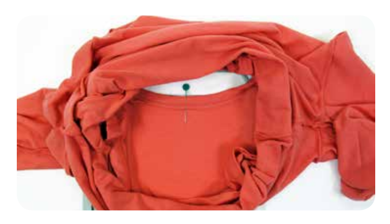
Stitch color 2, the tackdown.

Smooth the shirt to the hooped stabilizer. Nest the shirt above the hoop and transport the hoop to the machine. Use painter's tape or clips to tame the bulk of the shirt.