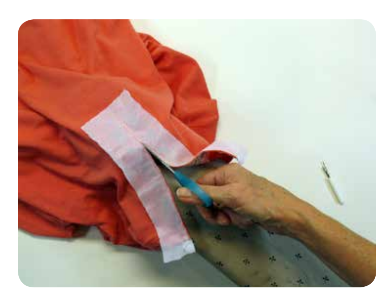
Clip as close to the corners as possible without snipping the stitches.

Cut the shirt between the center stitched lines.