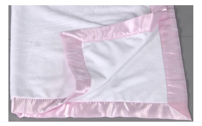
You are finished! Enjoy!

Please visit <u>letsgosew.com</u> for updates and additional project instructions.