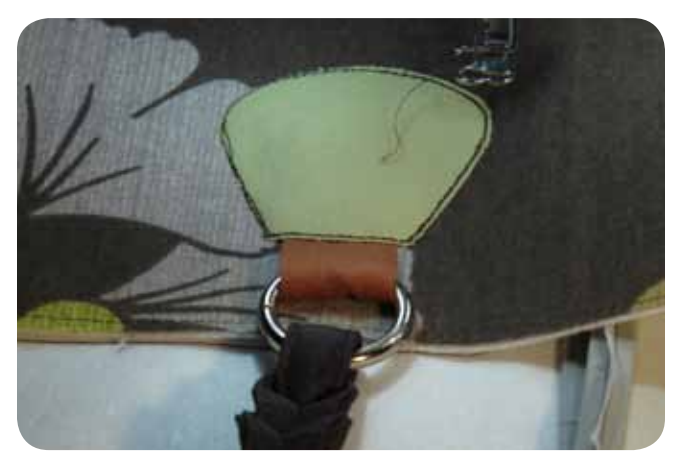
Designs in Machine Embroidery • Volume 71 • November/December 2011 • www.dzgns.com

Place the prepared ScallopConnectorApp over the connector outline. Consider spraying the wrong side of the applique with temporary adhesive to hold it in place. Stitch color 4, the applique tackdown.