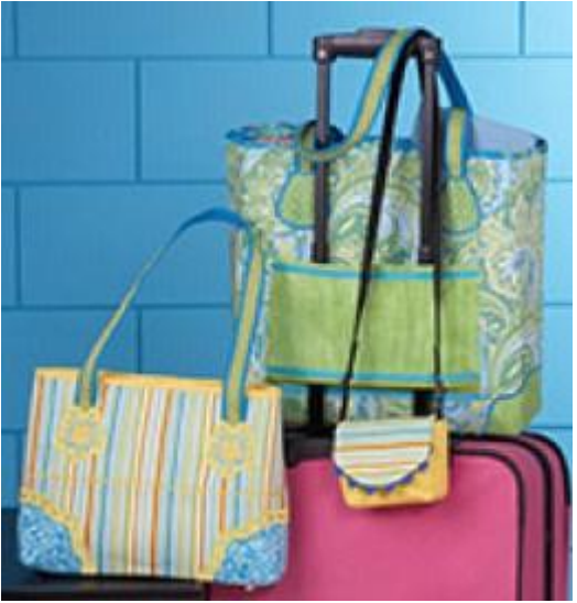
Please continue to page 4 for project instructions.