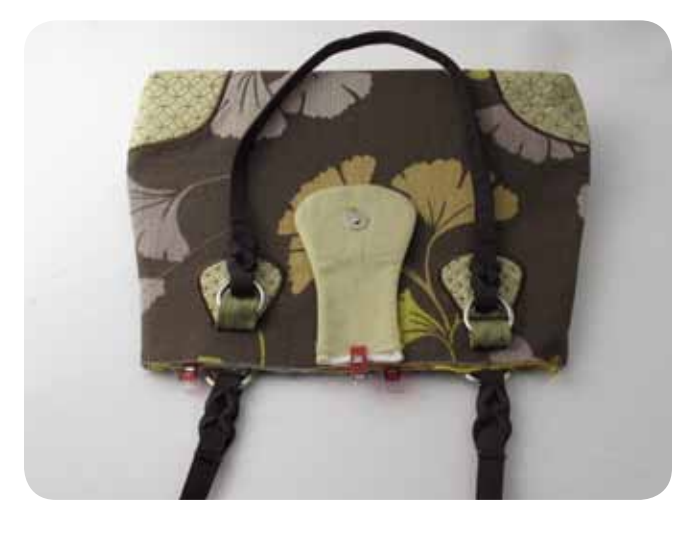
Bind the top. Flip the tab to the bag front and snap in place. Wow! You're done – what a great job!