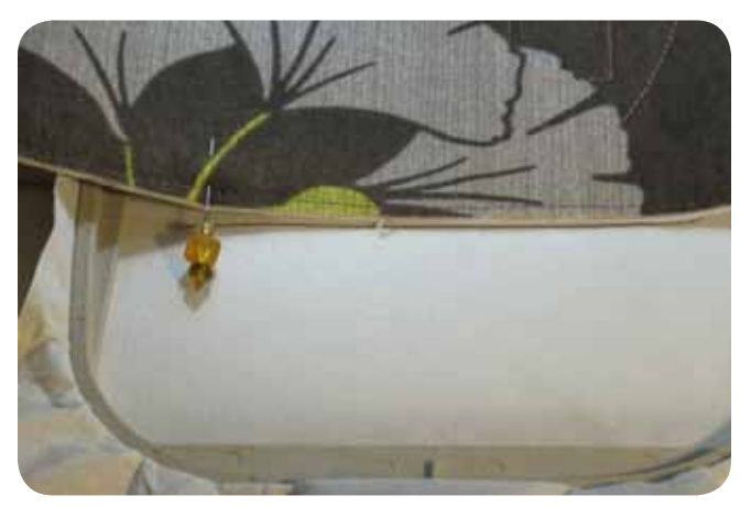
Slide a 5" loop of seam tape, fabric or ribbon through the ring on the strap. Position the loop on the stitched outline. Stitch color 3, the strap tackdown.

Stitch color 2, the placement guide for the connector and strap.