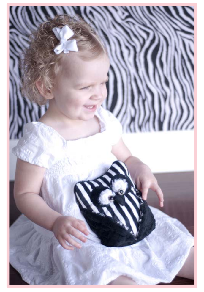
Capes, baby booties and stuffed animals