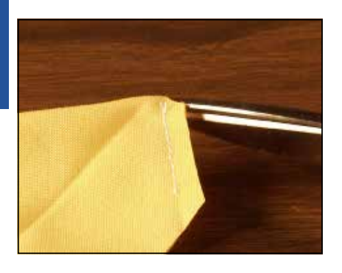
Turn right side out.

Trim the seam to 1/4 inch. Clip into the fold at the corner. Carefully press the seam open.