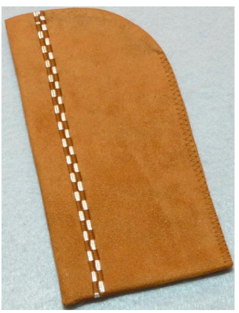
You'll find a tutorial for adding an embroidered monogram at <u>letsgosew.com</u>. It's included with Bonus Materials for It's Sew Easy TV series 1700.