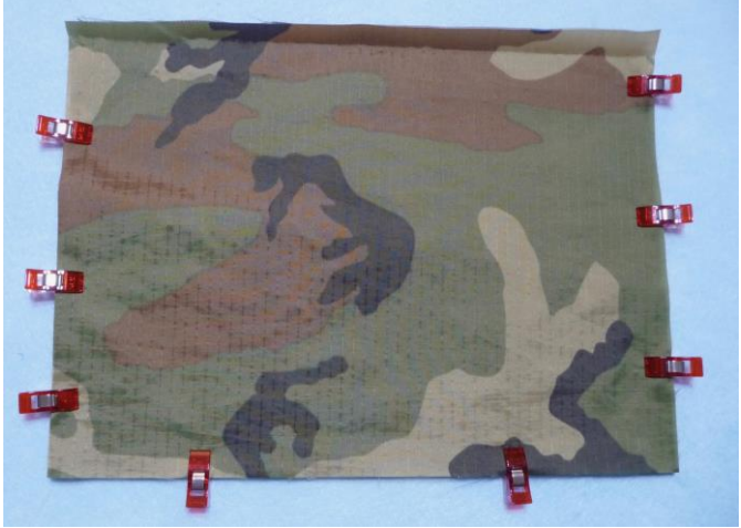
Fold raw edges under 1/2-inch at the top and close opening by stitching close to the edge.