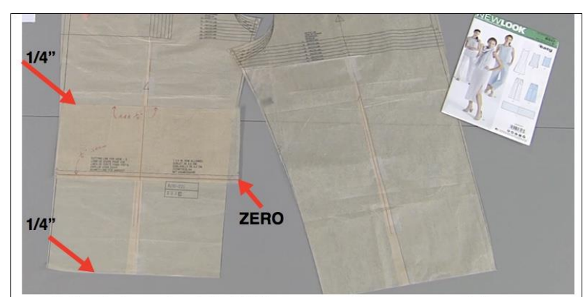
4-inch band with 1/4" seam allowance added to cut edge at top & bottom edge of band. Zero seam allowance at hemline.

Make a blouse using contrast fabric, reserving extra fabric for trimming pants. Cut pants pattern to make hem bands adding seam allowance at each cut edge. You will want to eliminate all hem allowance at the bottom to prepare edge for bias binding. I cut my pattern to create a 4-inch decorative hem band with seam allowance added at each edge.