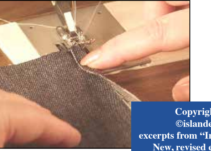
Copyrighted material ©islandersewing.com excerpts from "Industrial Shortcuts 1" New, revised edition available at www.islandersewing.com

Open the layers out right side up and stand the seam up. Fold the seam over to cover the raw edge.